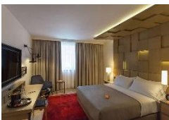
Canopy by Hilton Zagreb from 110 EUR

Other hotels in the vicinity of the venue include: