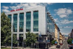
Hotel Central from 90 EUR