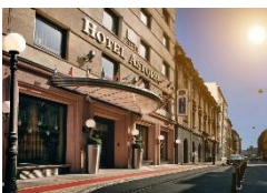
Best Western Premier Hotel Astoria from 125 EUR